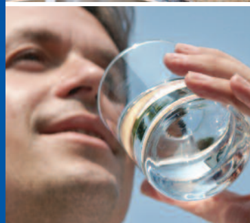
Better Tasting Water